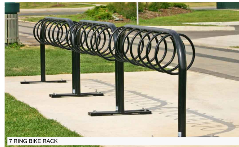
7 RING BIKE RACK