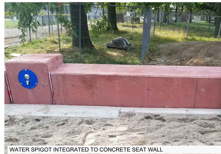
WATER SPIGOT INTEGRATED TO CONCRETE SEAT WALL