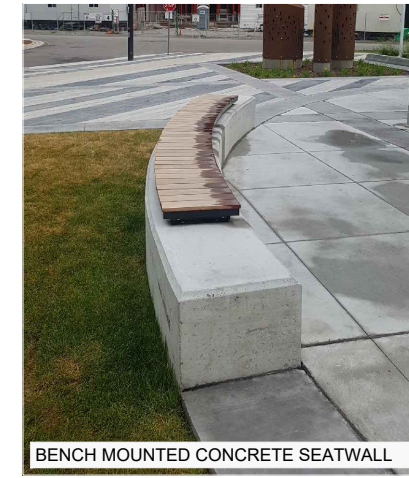
BENCH MOUNTED CONCRETE SEATWALL