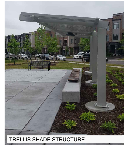
TRELLIS SHADE STRUCTURE