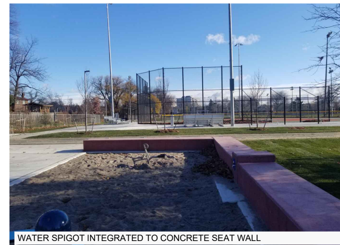
WATER SPIGOT INTEGRATED TO CONCRETE SEAT WALL