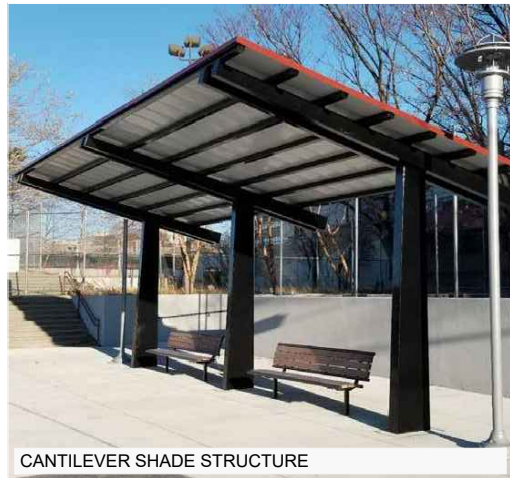
CANTILEVER SHADE STRUCTURE