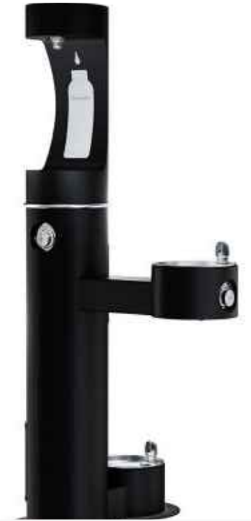
TRI-LEVEL WATER FOUNTAIN WITH PET STATION