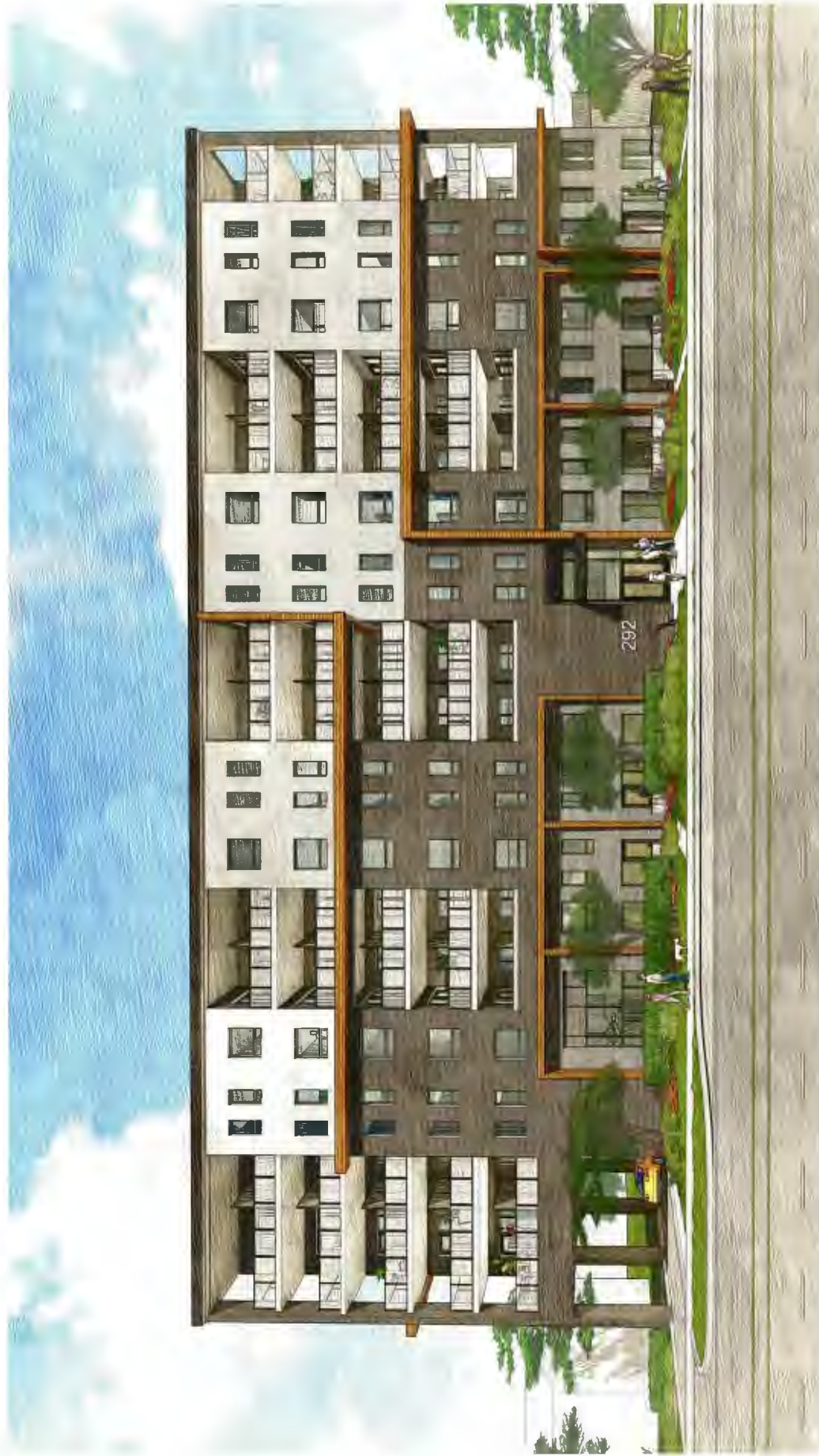
NORTH ELEVATION VIEW 284-292 PLAINS RD. E, BURLINGTON