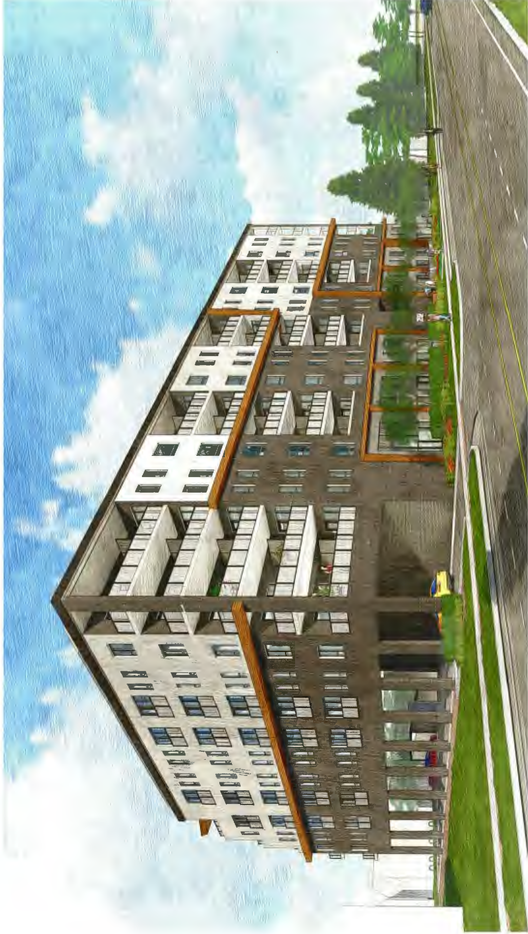
PERSPECTIVE VIEW LOOKING WEST 284-292 PLAINS RD. E, BURLINGTON