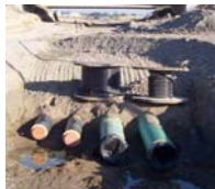
Distribution Piping 50 km