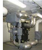
Building Connections 10 million ft 2