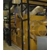
CHP 15.5 MW

Property, Plant & Equipment totals $160 million Markham's equity investment - $40 million