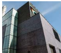
Energy Plants 4