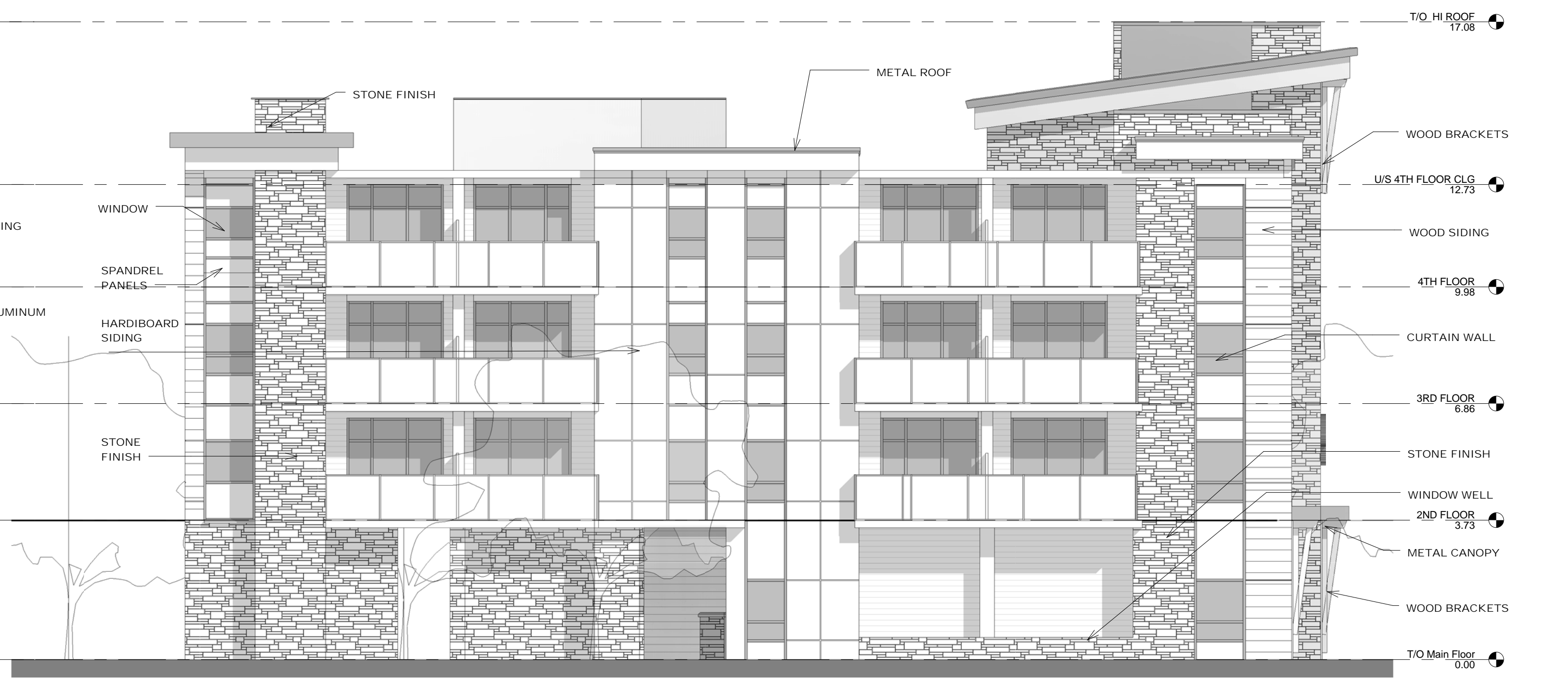
4 EAST ELEVATION 1 : 100