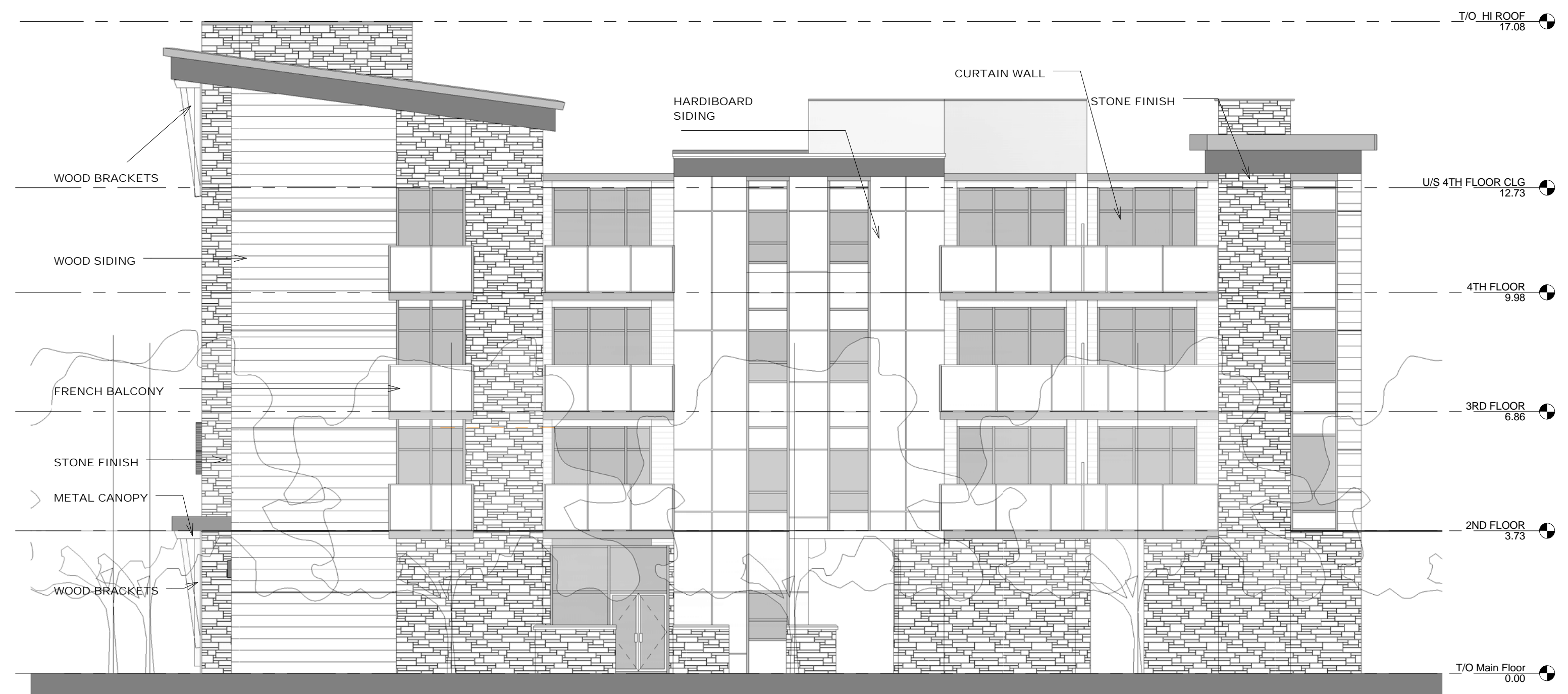
2 WEST ELEVATION 1 : 100