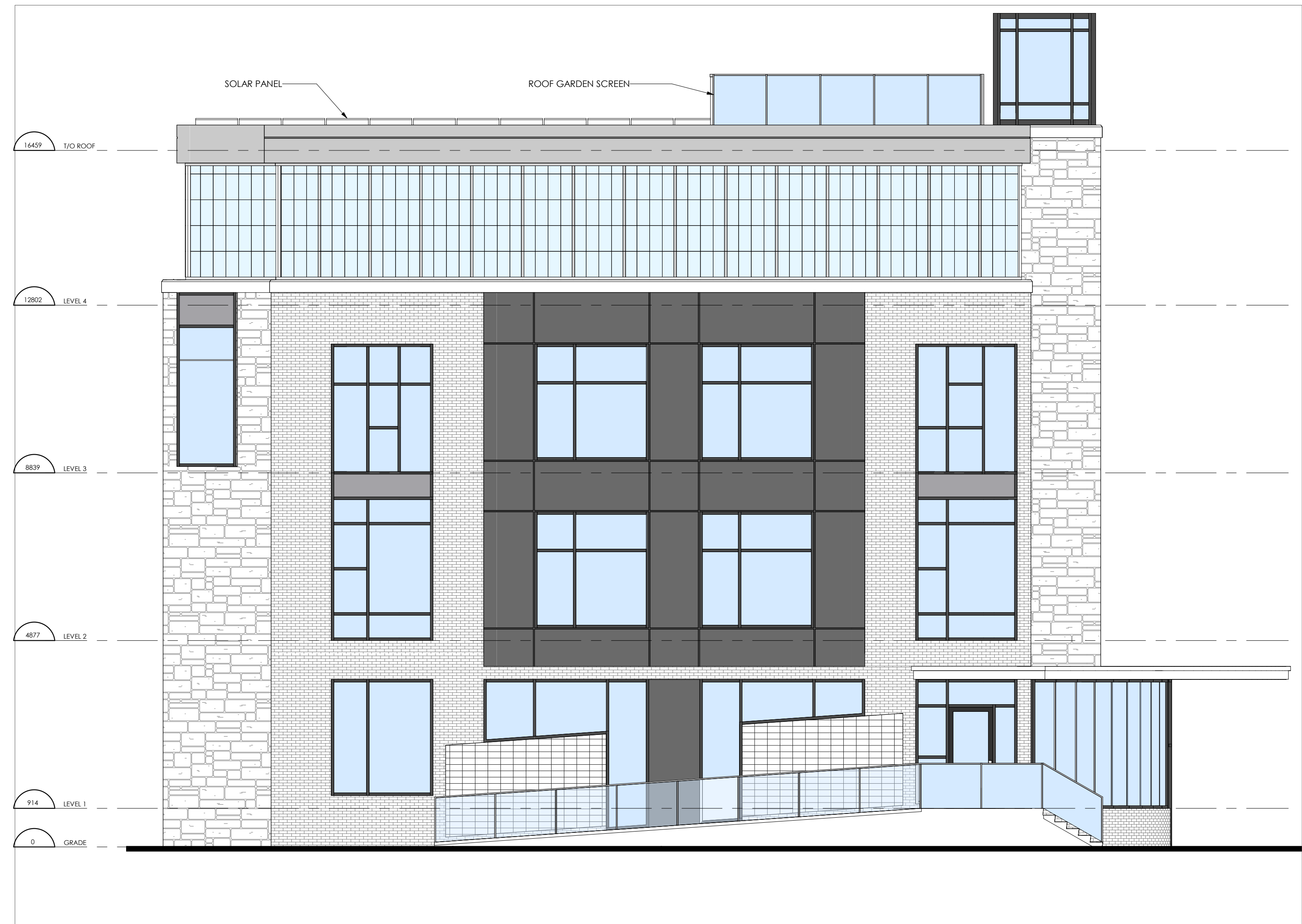
1 NORTH AS.1 1:75