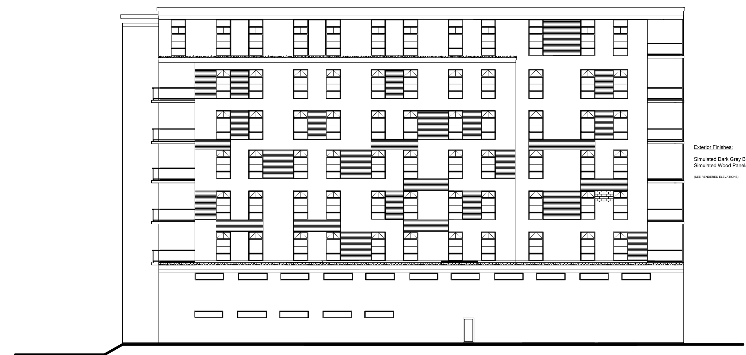
WEST ELEVATION (Townhomes)