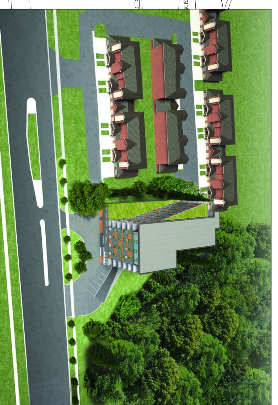
SITE PLAN SHOWING ADJACENT TOWN HOMES

CONTRACTOR IS TO CHECK AND VERIFY ALL DIMENSIONS ON THE JOB SITE AND NOTIFY DESIGNERS OF ALL DISCREPANCIES BEFORE INITIATING WORK. ALL DRAWINGS ARE THE PROPERTY OF THINKGIROFTE AND ARE NOT TO BE REPRODUCED WITHOUT WRITTEN PERMISSION FROM DESIGNERS. PRINTS ARE NOT TO BE SCALED.